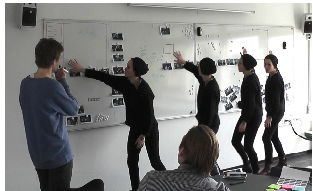
Figure 4. Example of a very large gesture.

Participants used views of data both side-by-side and one-by-one depending on the situation. This suggests enabling both styles of interaction with data. It also suggests a need to improve our understanding of when it makes sense to use space rather than interaction.