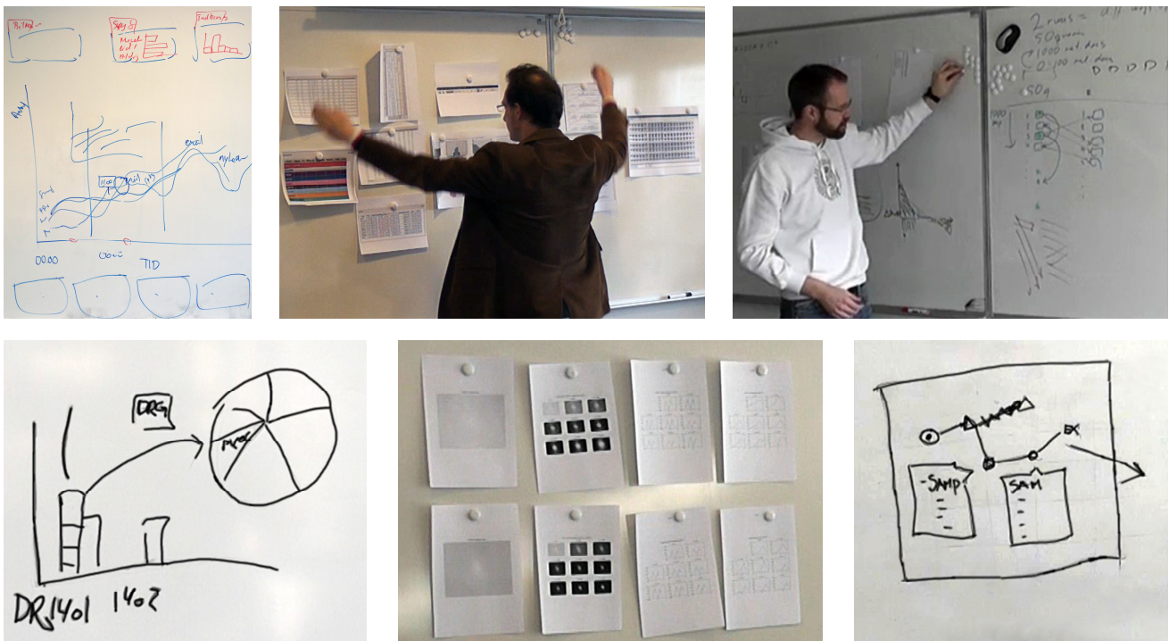
Figure 3. Top-left: Analyzing cellphone subscriber behavior on smartphones. Top-middle: A participant show how information views would be positioned in a user's peripheral view. Top-right: A participant uses a magnet to illustrate a flicking gesture. Bottom-left: Tree of plots. Bottom-middle: gray-scale images, processed images and image feature-plots of two galaxies. Bottom-right: Representation of data processing flow.

The two approaches represent a tradeoff between use of space and interaction. Although space is preferred for many purposes, interaction over time is nevertheless preferred in some situations. For instance, in workshop I (75:15-75:35), participants compared sets of data by flicking back and forth between them. They started by defining what data to compare using checkboxes. Then they talked about viewing data one-by-one: You could perhaps define two views that are [in] the same space and then say; well can I have one or the other, one or the other [said while doing a flicking gesture and looking at the data]. They did this to understand